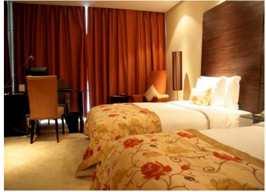
5 Star-Crowne Plaza Zhengzhou