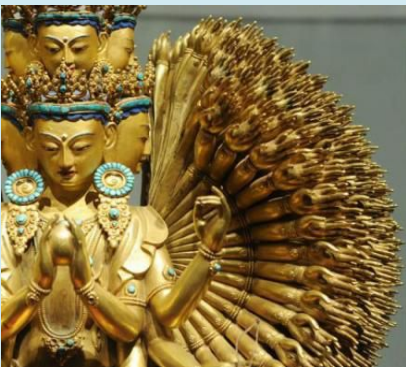
Henan Museum Exhibit