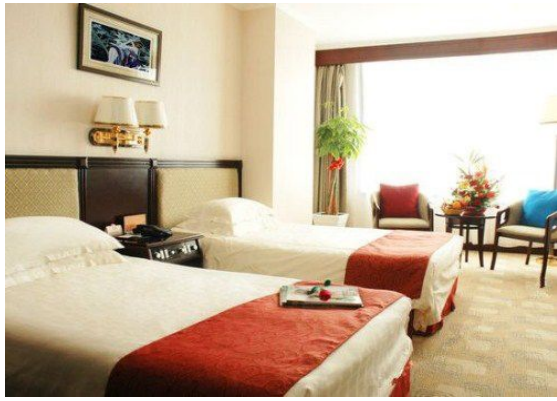
4 Star –Xinhuajianguo Hotel