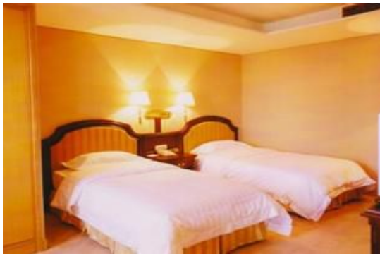
4Star- Guilin Hotle