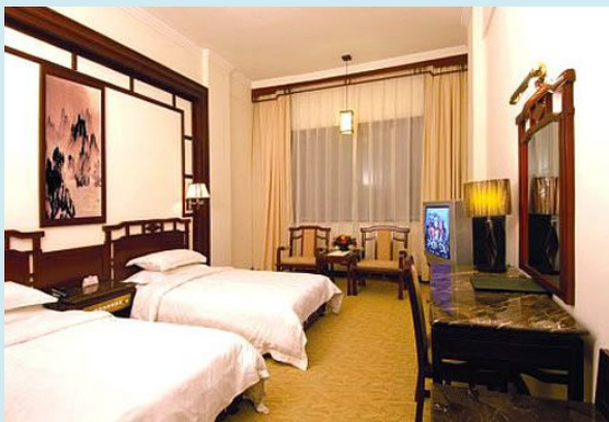
4Star- Yangshuo New Century Hotel