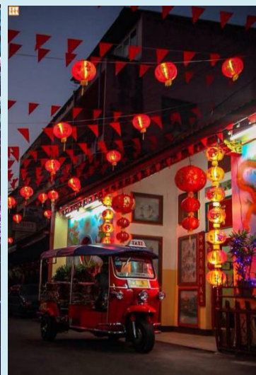
China Town & Flower Market