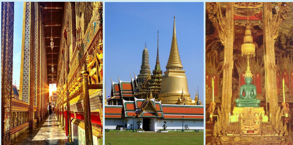
The Grand Palace & Emerald Buddha