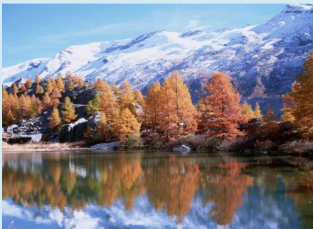
Jade Dragon Snow Mountain