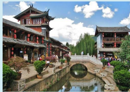
Lijiang Ancient Town