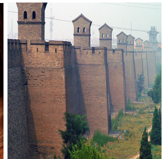
Pingyao City Wall